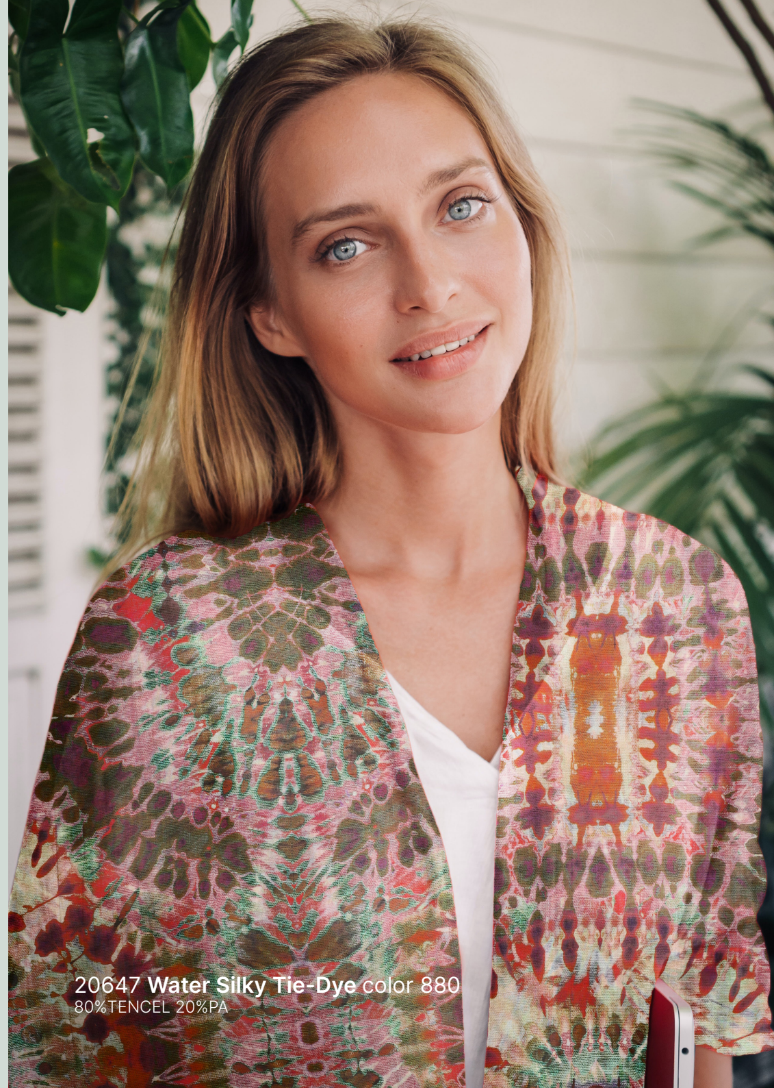
20647 Water Silky Tie-Dye color 880 80%TENCEL 20%PA