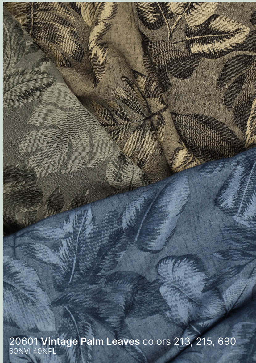
20601 Vintage Palm Leaves colors 213, 215, 690 60%VI 40%PL