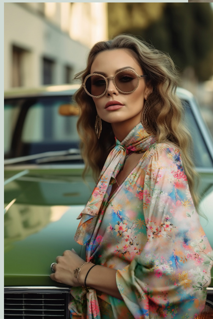
20640 Romantica Fine Lurex Rayon color 320 78%VI 22%ME