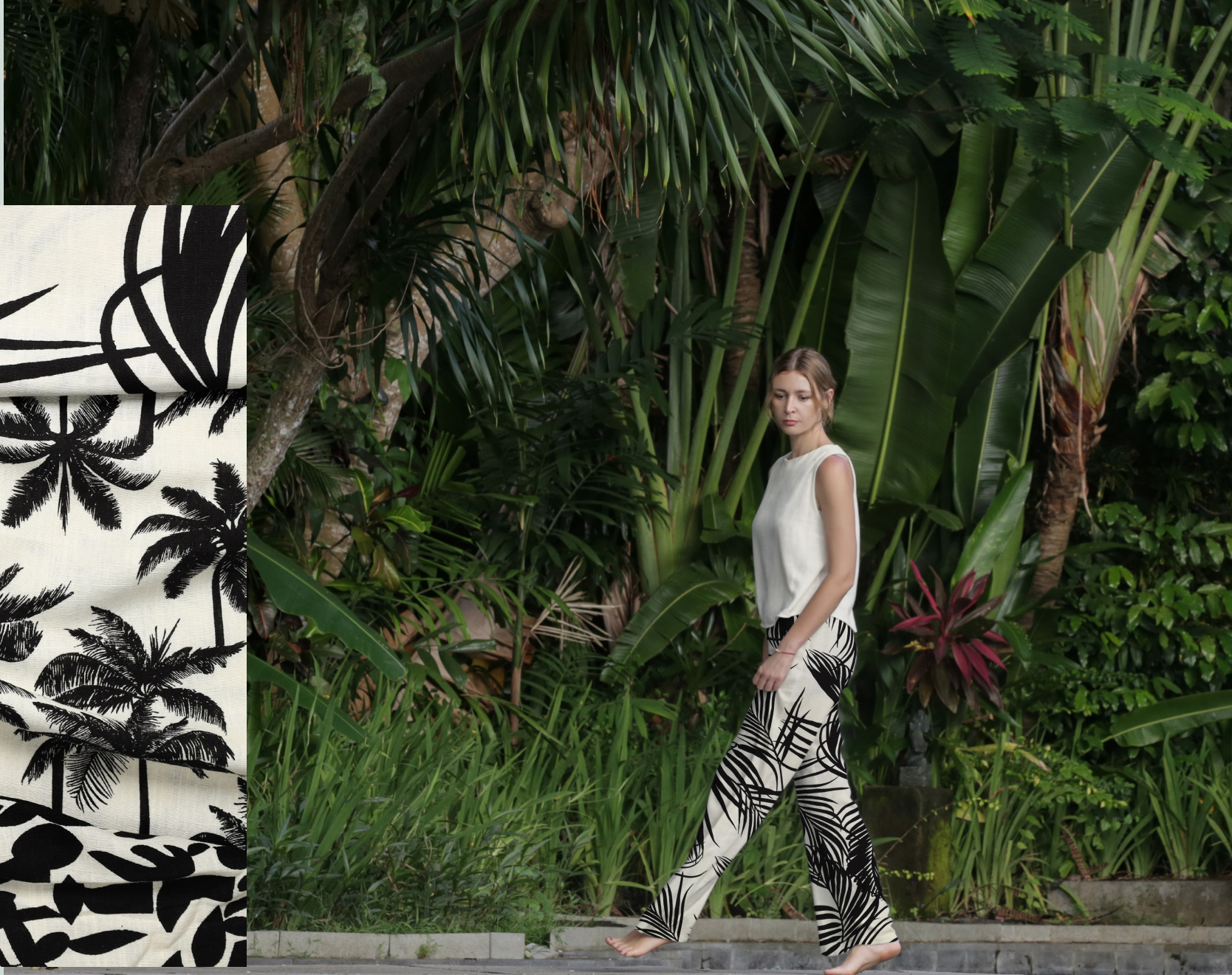
0999 Royal Linen color 020 100%LI