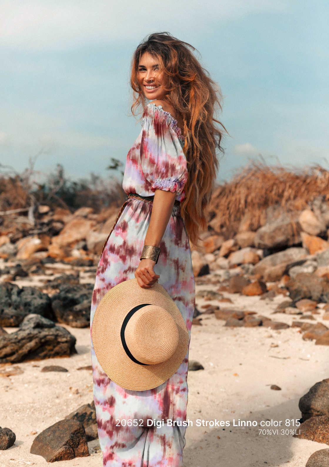
20652 Digi Brush Strokes Linno color 815 70%VI 30%LI