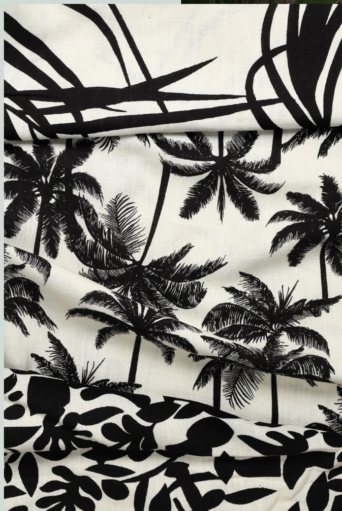
20660 Linen Slub Caren colors 022, 021, 020 75%VI 25%LI