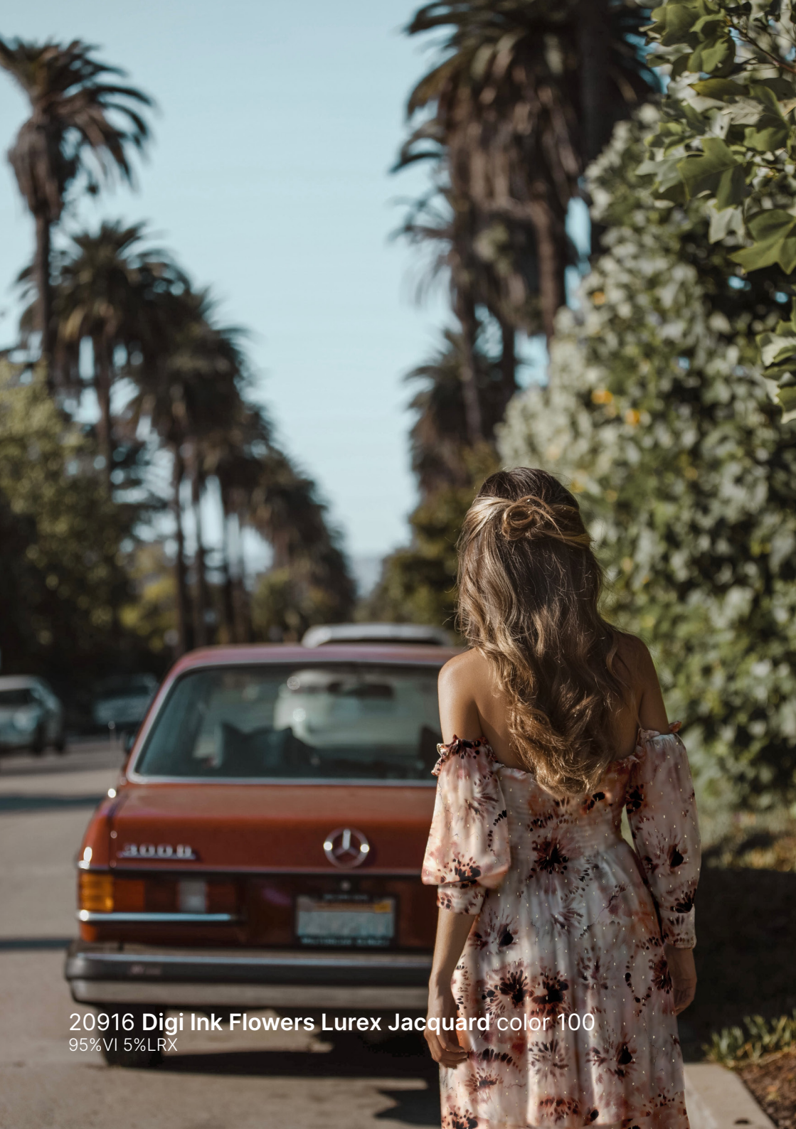
20916 Digi Ink Flowers Lurex Jacquard color 100 95%VI 5%LRX