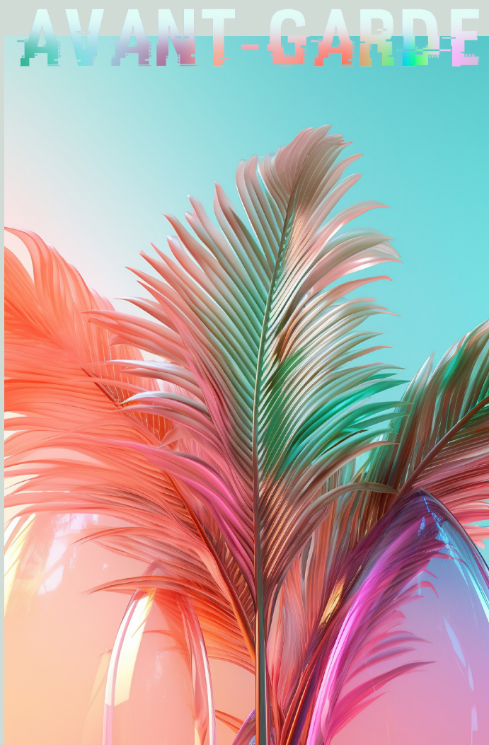
Cover: 20885 Digi Tropical Leaves Lin color 445 70%VI 30%LI 0739 Linen Journey color 020 70%VI 30%LI