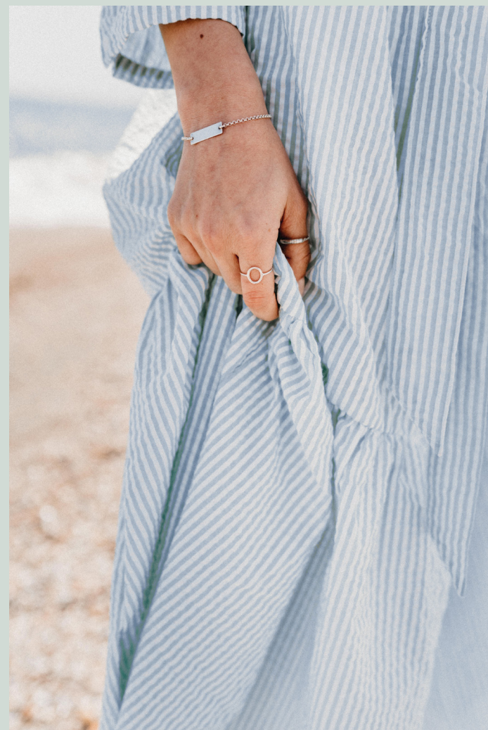
0951 Seersucker Stripe color 635 50%CO 50%PL