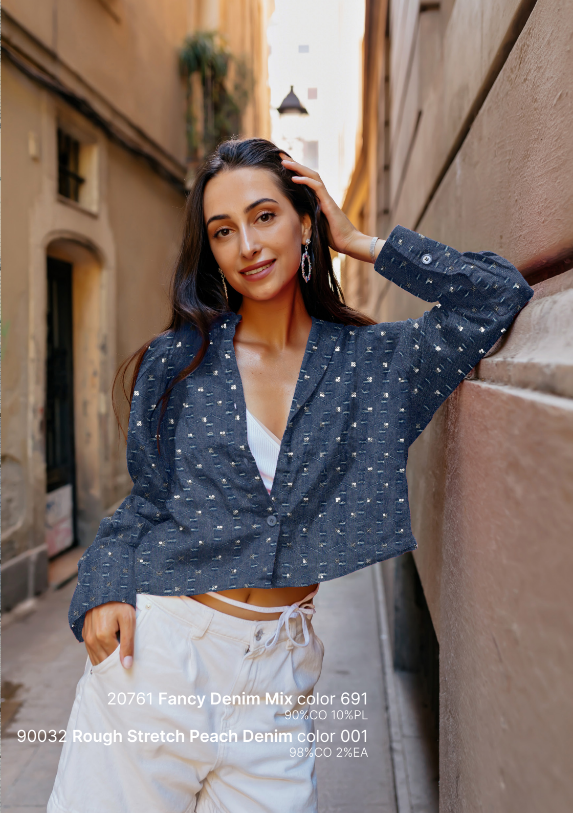
20761 Fancy Denim Mix color 691