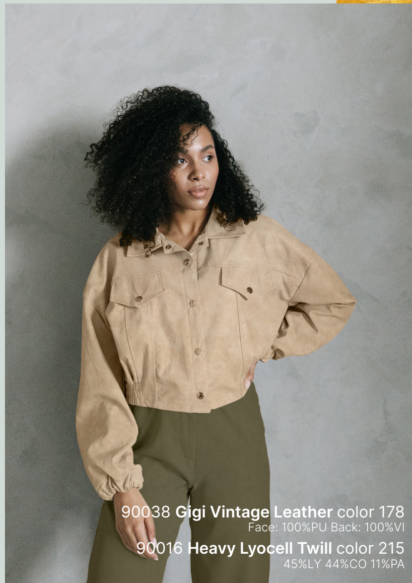
90038 Gigi Vintage Leather color 178 Face: 100%PU Back: 100%VI 90016 Heavy Lyocell Twill color 215 45%LY 44%CO 11%PA