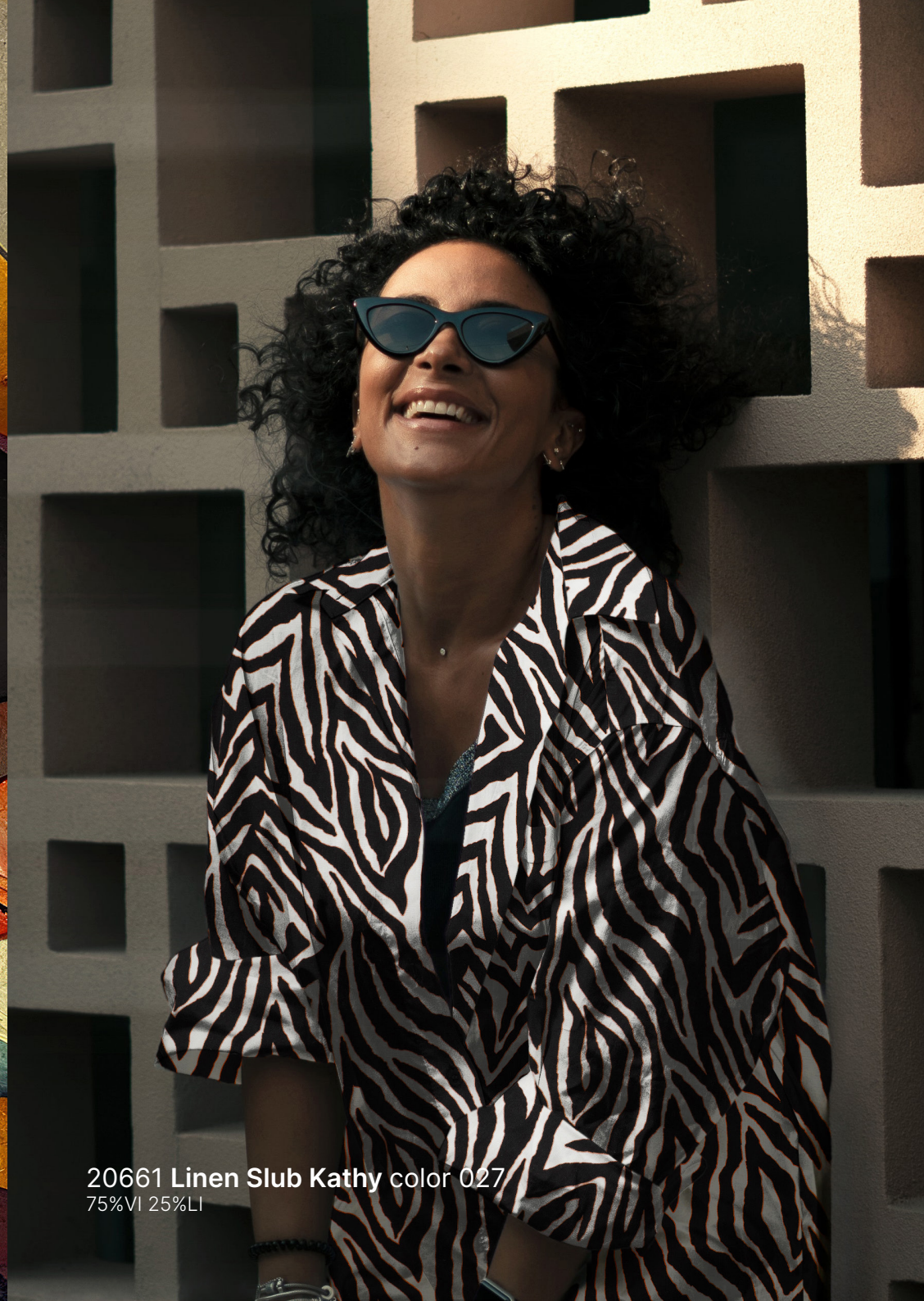
20661 Linen Slub Kathy color 027 75%VI 25%LI