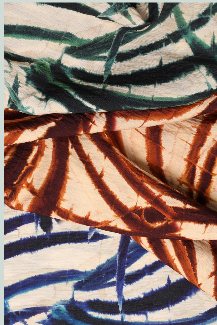
20878 Digi Tie Dye Bamboo Rayon colors 200, 445, 650 80%VI 20%PA