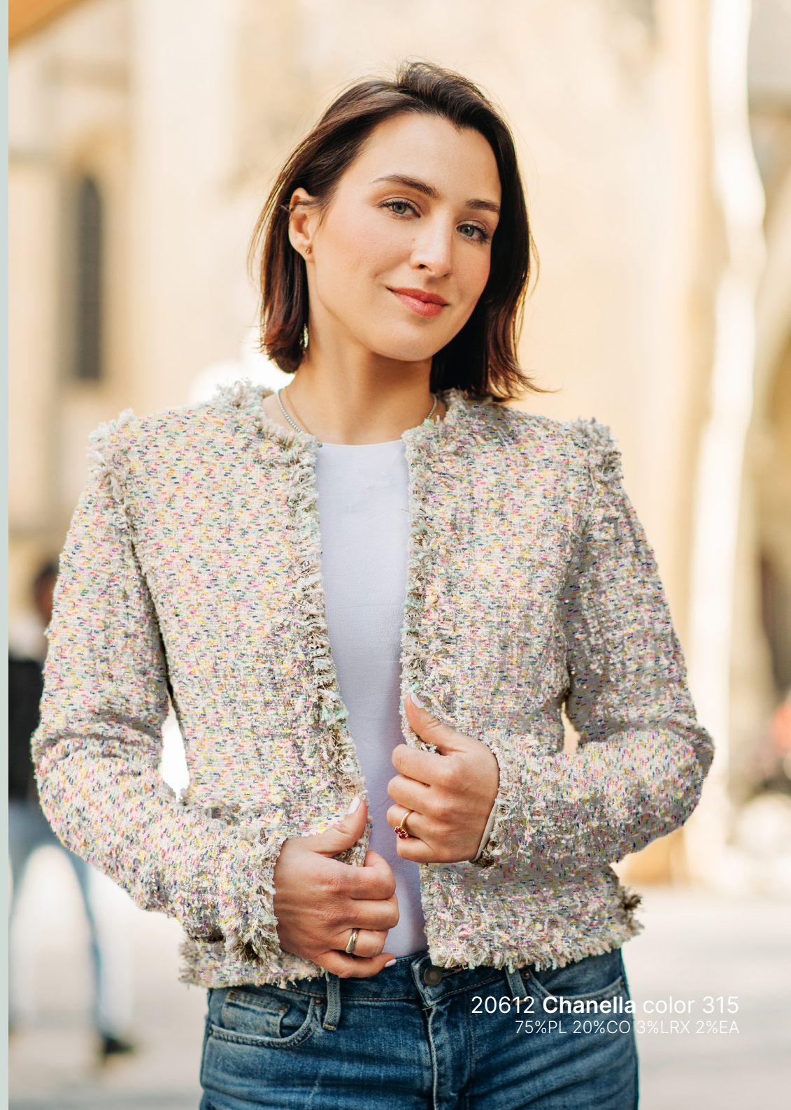
20612 Chanella color 315 75%PL 20%CO 3%LRX 2%EA