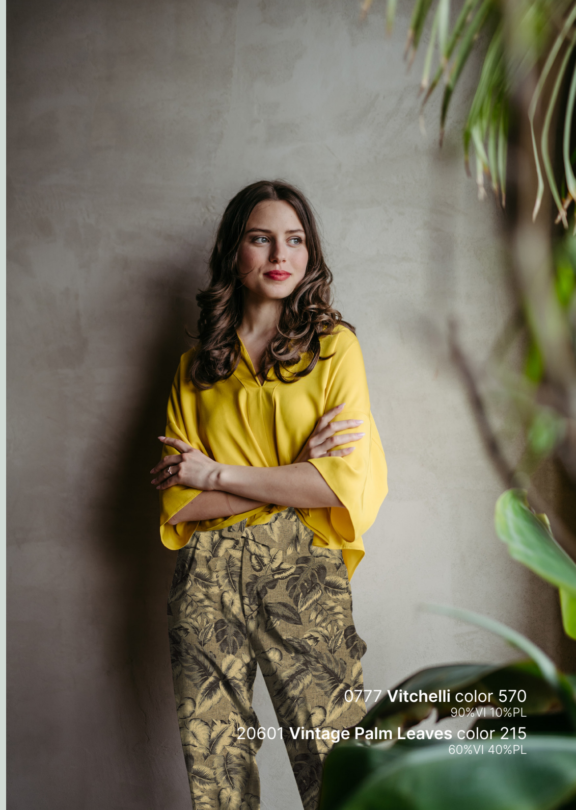
0777 Vitchelli color 570 90%VI 10%PL