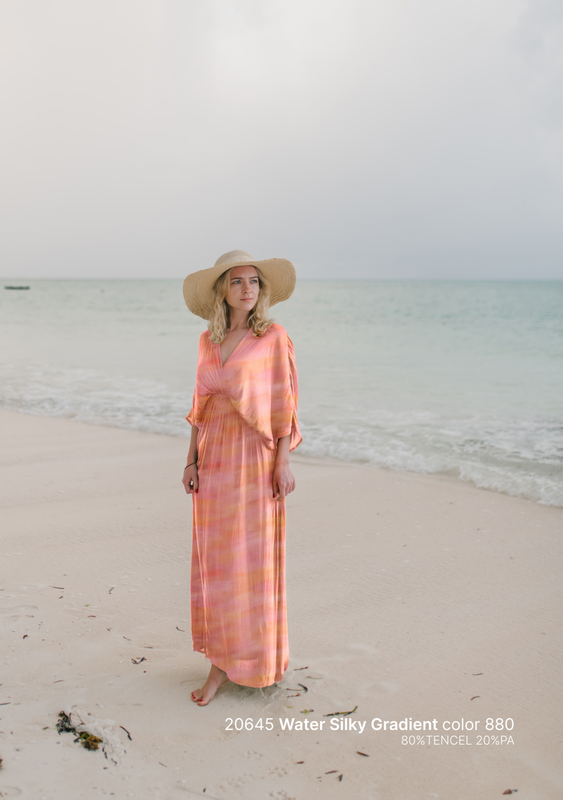
20645 Water Silky Gradient color 880 80%TENCEL 20%PA