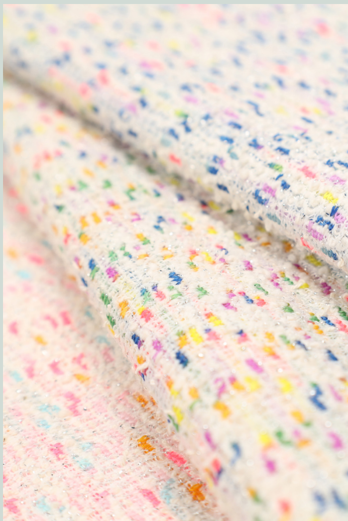
20612 Chanella colors 875, 315, 650 75%PL 20%CO 3%LRX 2%EA