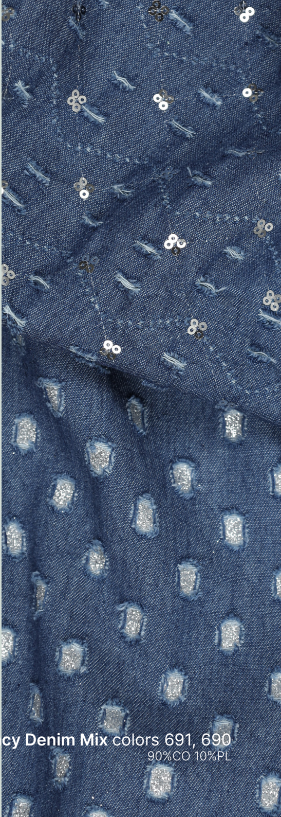
20761 Fancy Denim Mix colors 691, 690